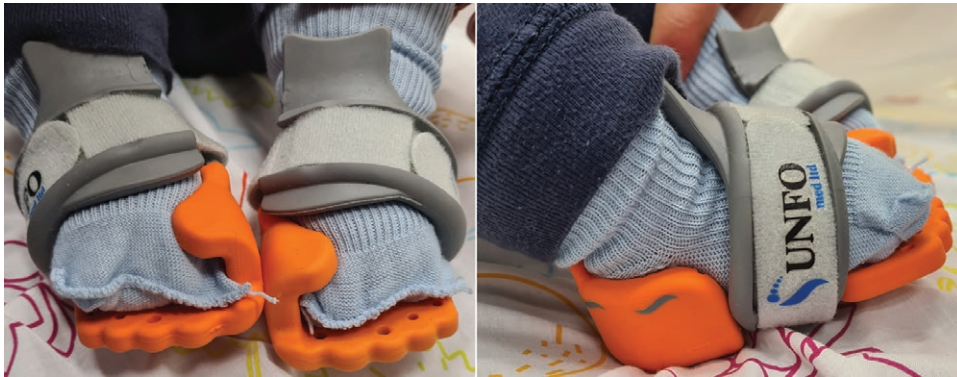
A 3-month-old baby with the UNFO (Med Ltd.; Holon, Israel) shoes on. UNFO, Universal Neonatal Foot Orthotic.

with RFAD. We extracted the data from electronic medical records of all patients who presented to our hospital between 2012 and 2019 with the diagnosis of FAD. The extracted data included: age, sex, type and length of treatment, any complications, and recurrences. During the years 2012–2017, we treated all RFAD patients with casting and splinting protocol. From the beginning of 2018, we switched our treatment to UNFO. We, therefore, compared two retrospective cohorts – casting and splinting treatment (2012–2017) to UNFO treatment (2018–2019).